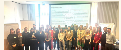
Joint event with VDM (Verbund deutscher Metallhändler und Recycler)