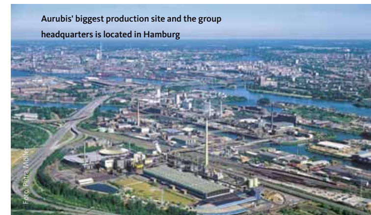
Aurubis' biggest production site and the group headquarters is located in Hamburg