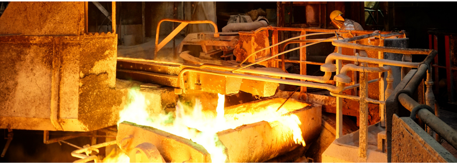
Metal Refining & Processing